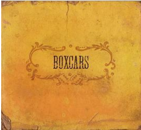
Release Date: May 2007 Label: Smith Music Group